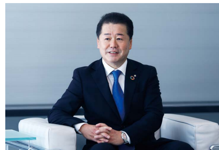
President Representative Director