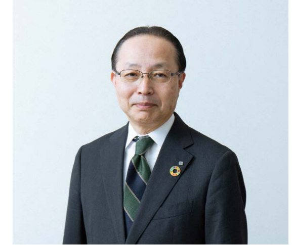
Director and Executive Vice President, General & Administration

Our capital investment plan for FY2023 is 50.3 billion yen. In order to make the most of this capital investment, the largest in our history, I believe it is also important to standardize our operations and improve our information infrastructure. By harnessing centralized data, and applying it to the deployment of smart factories and the improvement of services for customers, we will further step up the pace of growth. I believe