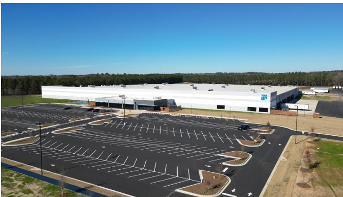
Exterior view of the factory

Located in central Georgia, the Macon Factory was built on a new site acquired approximately 20 minutes by car from the former Macon Factory. All manufacturing functions of the former factory, which had previously been dispersed across the two locations, have been transferred to establish an integrated production system for vinyl windows. This will strengthen the production and supply capabilities to improve the company’s competitive advantage, with the aim of increasing sales of residential products throughout the six southern states of in the U.S.A.